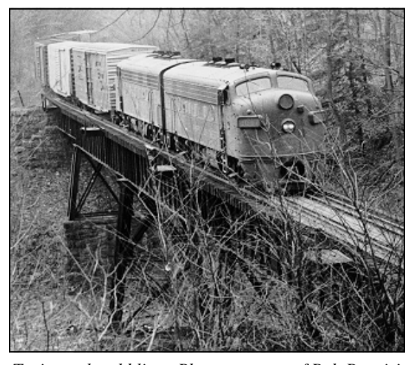
Train on the old line.